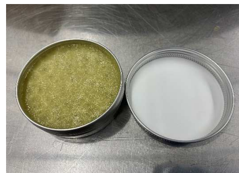
Product of Vermont USA